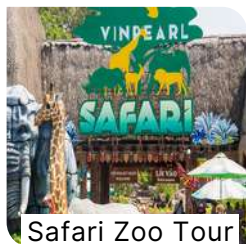
Safari Zoo Tour

Meals Breakfast at hotel Lunch at local restaurant Dinner at Seafood restaurant