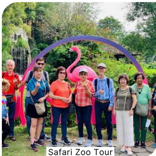
Safari Zoo Tour