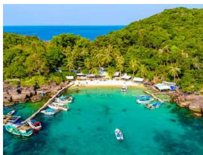
May Rut Isle

Meals Breakfast at hotel Buffet Lunch on Pineapple Island Dinner at local Vietnamese Restaurant