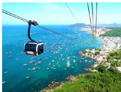
Pineapple Island Cable Car